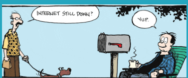
The Internet is still down...

I hit the CTRL key but I'm still not in control!