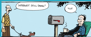
The Internet is still down...

I hit the CTRL key but I'm still not in control!